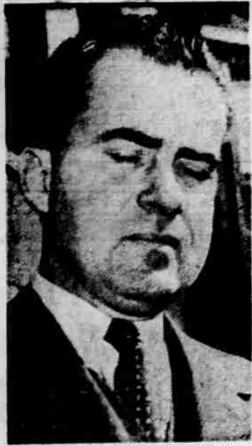
NIXON IN PRAYER — Vice President Richard Nixon closes eyes during opening prayer at ceremonies opening National Association of Home Builders' National Housing Center in Washington, D. C. Nixon was principal speaker at the dedication.