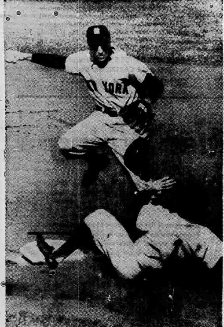
HURDLES —Yankee shortstop Phil Rizzuto leaps high to avoid the sliding Pee Wee Reese after making the force on the Dodger shortstop in the first inning of the fifth World Series game at Ebbets field in Brooklyn. Duke Snider's grounder to Billy Martin started the play. The Dodgers won, 5-3.

Ottawa—(U.P.)—Evangelist Billy Graham said Sunday night he thought the Brooklyn Dodgers would win the World Series but said he wished they wouldn't play ball on Sundays.