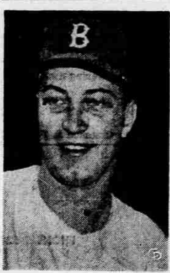
KEEPING firm control of game, Johnny Podres pitches Brooklyn Dodgers to first victory over New York Yankees by 8-3 score.

Beaten by the Yankees five times before in series competition, the Dodgers were in a position to rub salt in the Bronx Bombers' widening wounds. Stengel, who already has said