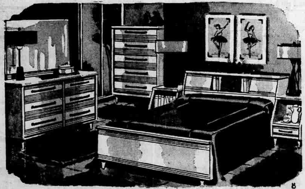
Night Stands and Chest Extra