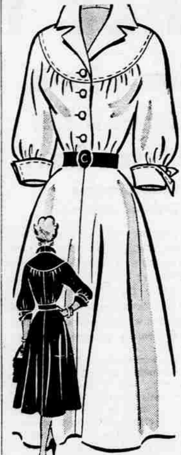
9277 12-20; 30-42 by Marian Martin

readers, have chosen for your fall and winter favorite! So flattering to the figure, we've cut it in sizes from 12 to 42! So casual, you can wear it 'round the day! So smart, too; you'll love its dashing lines, graceful yoke detail.