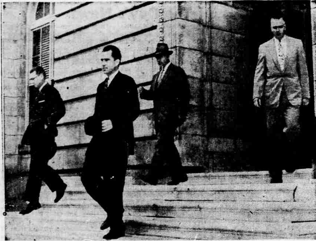
NIXON'S GUARD INCREASED —Vice President Richard Nixon leaves Senate Office Building under increased 24-hour guard of Secret Service men. Prior to the President's illness a single agent was assigned to Nixon during office hours.