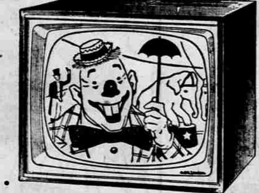
RCA Victor 21-inch Towne. Budget-priced beauty with the famous Oversize "All-Clear" picture—21-inch TV's biggest and clearest! New "Hidden Panel" Tuning. New Balanced Fidelity Sound. Black textured finish. Matching stand, extra. Model 2156052. $179 95 $18 Down $8 Month