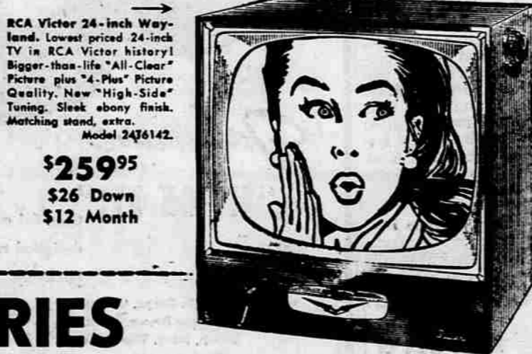
RCA Victor 24-inch Wayland. Lowest priced 24-inch TV in RCA Victor history! Bigger-than-life "All-Clear" Picture plus "4-Plus" Picture Quality. New "High-Side" Tuning. Sleek ebony finish. Matching stand, extra. Model 2476142. $259 95 $26 Down $12 Month

SEE The SERIES You can see the World Series in your own home. We will make immediate delivery and installation. Choose your RCA Victor today. Ask about the exclusive RCA Victor Service Contract