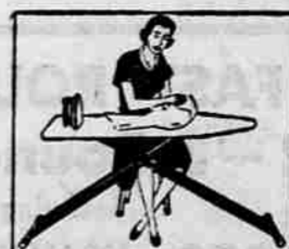
Iron While Standing