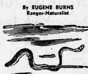
By EUGENE BURNS Ranger-Naturalist

AT that moment, the dog waded in. You know the rest. The upshot of the affair was a pair of ruined boots and a practically ruined dog. The porcupine waddled off. Porky is a rugged character.