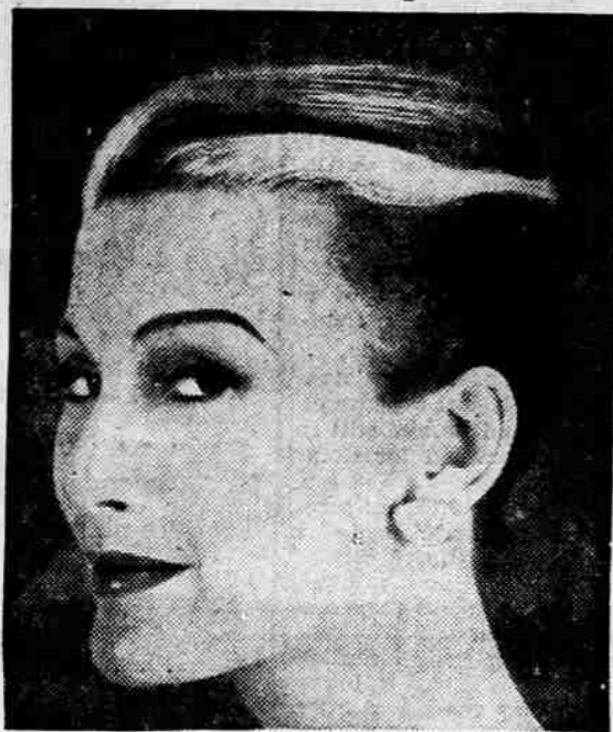
FASHION NOTE: Thrilling new use of a silver streak high over a pretty ear.

Preens and Polishes Every Strand of Your Hair!