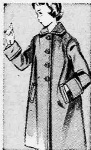
GIRLS' 100% WOOL FLEECE COATS 16.75

Sizes 3-6x ..... 14.75 See Penney's nice selection of smart fleece and check coats at a real Penney, money saving price. Lots of colors and styles. Sizes 7-14.