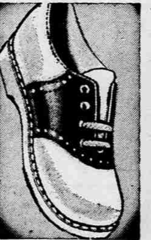
BROWN AND WHITE SADDLE OXFORDS 4.98

Snowy White—Penney's Sleek Saddle Oxfords come in rich smooth leather. White rubber moulded soles, sturdy made. Sanitized®. Sizes 3 1/2-9. Widths AA-A-B-C.