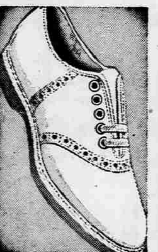
FAVORED WHITE SADDLE OXFORDS 5.90

Snowy White—Penney's Sleek Saddle Oxfords come in rich smooth leather. White rubber moulded soles, sturdy made. Sanitized®. Sizes 3 1/2-9. Widths AA-A-B-C.