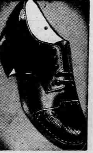
BOYS' OXFORDS With NON SUFF TIP 4.98

Penney's Famous Childcraft Quality — Double-Strap Shoes with fringe trim little girls like . . . a price mothers love! Ideal for school or play, with Good-year welt construction.