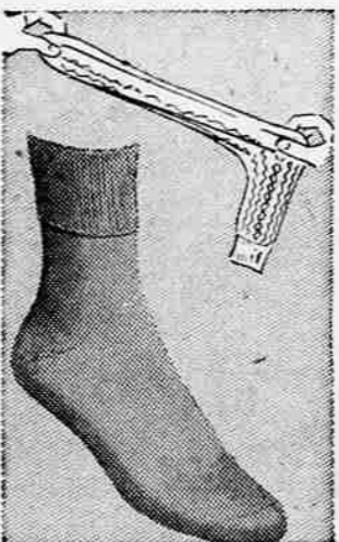
GIRLS' STRETCHABLE NYLON ANKLETS 49c Pr.

!Won't shrink more than 1%! *13 3/4 oz. per sq. yd.; Formerly 11 oz. 28"x36" fabric