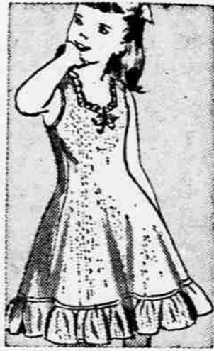
GIRLS' COTTON PLISSE SLIPS 98c

Sizes 3-6x ..... 14.75 See Penney's nice selection of smart fleece and check coats at a real Penney, money saving price. Lots of colors and styles. Sizes 7-14.