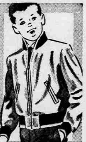
BOYS' PLASTIC LEATHER JACKETS 7.90

Wanted low-hip styling in boys' rugged thickest corduroys! Tapered leg model with patch pockets, pleats! Always - right colors. Practical machine washability. Sizes 6 to 12