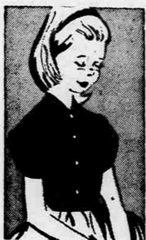
SANFORIZED COTTON SCHOOL BLOUSES 1.98

Elasticized lace trims the leg bands of these soft rayon and cotton briefs for girls. Pretty pastels and white—get all her favorite colors at this special value price! Sizes 2 to 14.