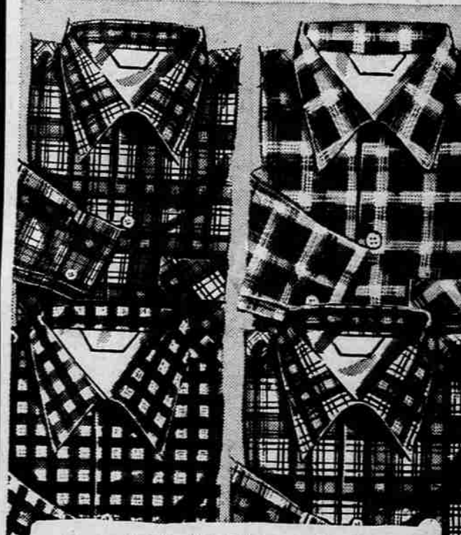
Boys' Plaid Flannels in Brand New Patterns!

Solid value rugged work shoes, oil tanned cowhide uppers to resist moisture. Men's 6 1/2-11-E. Boys' sizes 6-10 1/2. Thru 6, C & E widths. 4.79 pr.