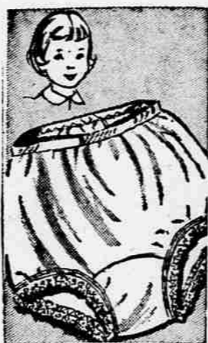
COTTON-RAYON KNIT PANTIES 39c Pr.

Girls' Cotton Plisse Slips . . . special priced for timely school savings! Machine washable . . . and no ironing, of course, because these are plisse. Snowy white in sizes 4 to 14.