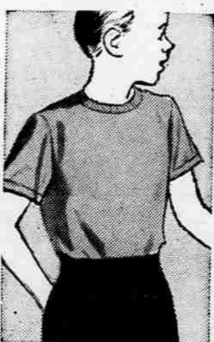
BOYS' COTTON KNIT T-SHIRTS 59c

Stretchable nylon cuff socks for girls! They wash beautifully, never lose their shape. Sizes Small, Medium, Large. At Penney's now! Nylon Reinforced Cotton Anklets ..... 3 for 1.00