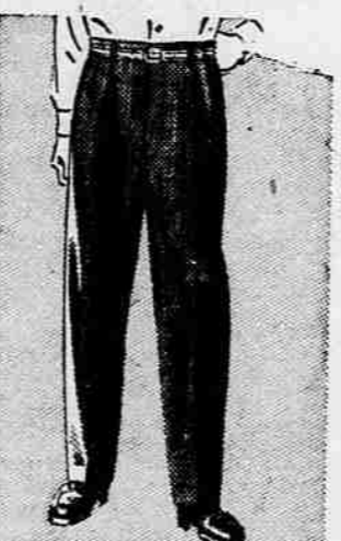
TAPERED LEG CORDS IN COLORS 3.98

Thrifty! Rugged! Penney's dungaree model corduroys for boys. Cut over proportioned patterns with bar-tacking, rivets, zipper fly! Gripper top. Cut extra long.