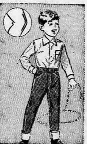
HUSKY JEANS FOR THE HARD TO FIT 2.29

Sizes 4-8 ..... 2.49 Terrific Penney value for corduroys in striking new colors! Pick from scarlet, pink, lemon, . . . more! Rugged wear. Thrifty machine washability. Rounded collar.