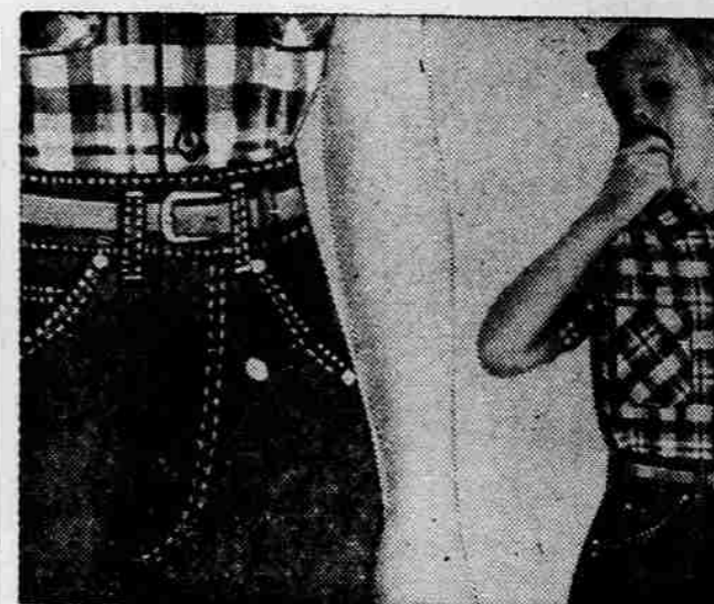
Slim Western Style! Boys' Foremost® Jeans

Crisp cotton blouses—the kind a girl can never have enough of—in colors to complement all her favorite skirts! Shown here, Penney's turquoise charmer to be mated with our paisley print skirt. Sizes 7 to 14.