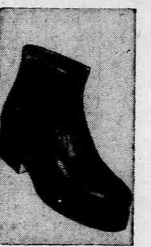
BOYS' STURDY HIGH TOP SHOE 4.79

At savings! Boys' favorite plastic jackets. Top quality plastic fused to cotton knit back! Quilt-lined. Wind, water resistant, smart contrast cuff, collar, waist knit trim! Sizes 10-18.