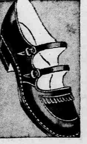
NEOLITE SOLE GIRLS STRAP 5.90 5.50

Saddles . . . Every Girls' Favorite Oxfords! With rubber soles and heels. White with brown. Sanitized®. Sizes 12 1/2-3. Widths A-B-C. Sizes 8 1/2-12 ..... 4.49 Widths B-C