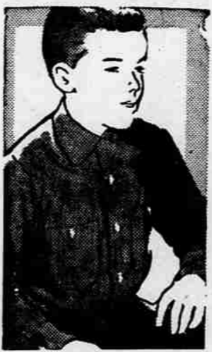
MACHINE WASHABLE CORDUROY SHIRTS 2.98

Fine gauge cotton T Shirts at a real money saving price. White only in sizes 4-16.