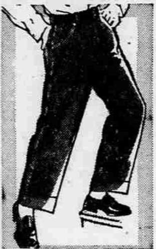
BOYS' CORDUROY JEAN PANTS 2.98

Yes 13 3/4 oz. Formost Jeans for that husky boy—Larger cut in hips and waist but they still have that western look. Sizes 10 to 16.