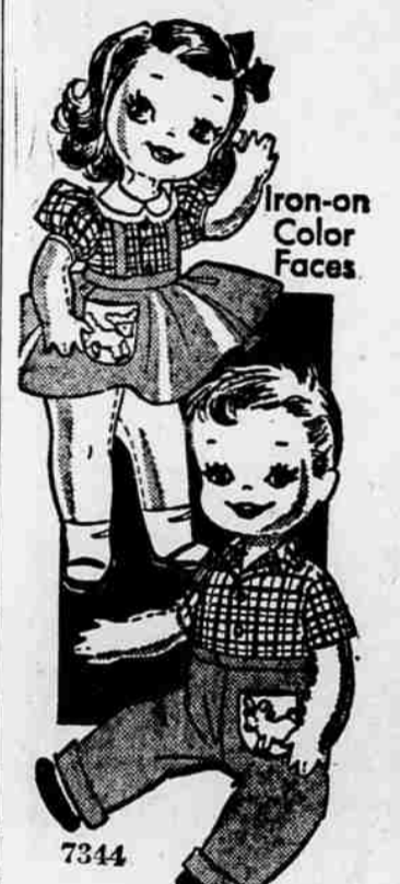
7344 by Alice Brooks

New! New! Dollmaking is easy with these iron-on faces in color. Children love these playmates!