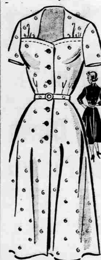
SIZES 14½—24½ 9086 by Marianne Martin

Half-sizes! Make this your new fall dress — for figure-flattery, unlimited wearability! Pretty suggestion of a sweetheart neckline — formed by soft gathers, graceful yokes. Comfortable step-in smooth styling — perfect fit for the shorter, fuller figure!