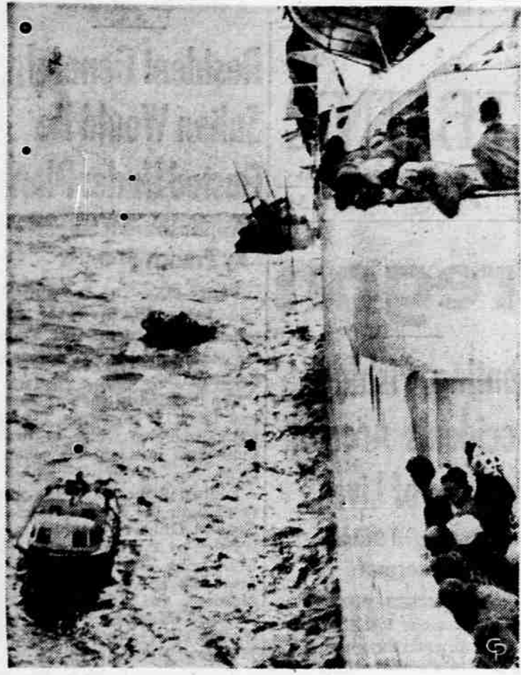
CROWDING RAILS OF LINER, passengers watch crew of Kungsholm man two lifeboats rescuing personnel aboard British freighter Argobeam in Atlantic off Scotland. Shattered by explosion and fire, freighter is wallowing in distance after being abandoned.