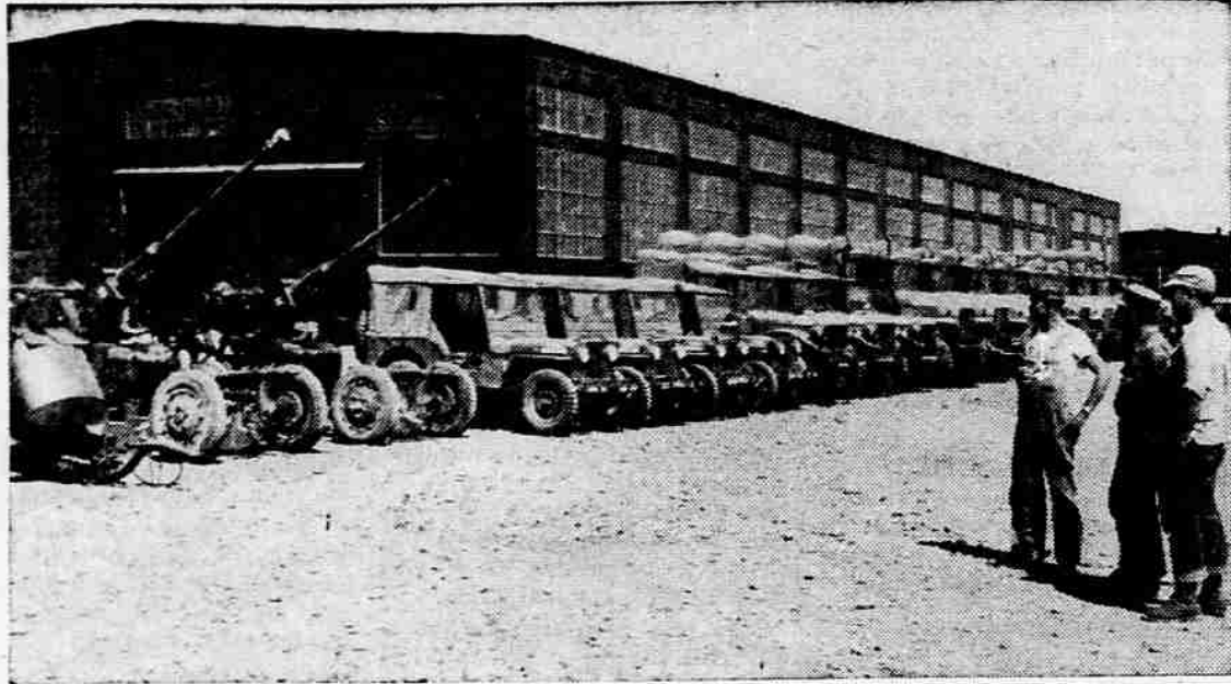
STORAGE FACILITIES —Concentration center mechanic Virgil Cool, left and ground maintenance men, Loyal Goodnough and Jack Burns look over equipment stored at the National Guard depot seven miles northwest of Medford on Table Rock rd. Cool services vehicles assigned to Southern Oregon Guard units and keeps them ready to be moved upon

Recently, the Central Point Rural Fire Protection district