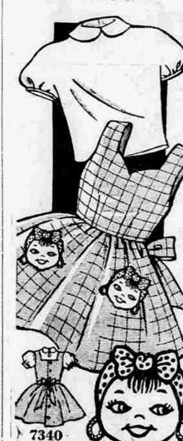
7340 SIZES 2-10 by Alice Brooks

Fun to wear this versatile jumper and blouse, with happy "faces" for pockets! Choose colorful plaid remnants—perfect for back-to-school. Thrifty, sew-easy! Pattern 7340: Children's sizes 2, 4, 6, 8, 10. Tissue pattern, face transfers, directions. State size. Send TWENTY-FIVE CENTS in coins for this pattern—add 5 cents for each pattern for 1st-class mailing. Send to Medford Mail Tribune Household Arts Dept., P. O. Box 168, Old Chesea Station, New York 11, N. Y.