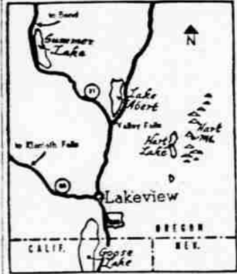
Map outlines dry lake country toured on Oregonian motorlog.

East of Lakeview, along the western edge of Hart mountain, lies the chain of Warner valley lakes. North of the county seat, near the center of big Lake county, are Abert and Summer lakes, both many miles in length.