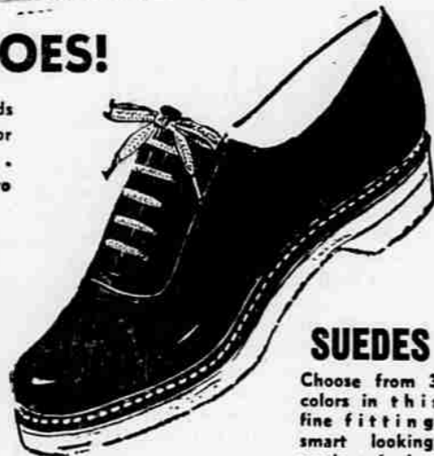
SUEDES Choose from 3 colors in this fine fitting, smart looking, suede oxford.

GIRLS! Here They Are! School Oxfords that are tops for looks... tops for wear... and for 4 DAYS only... they're at a price you can't afford to pass up!