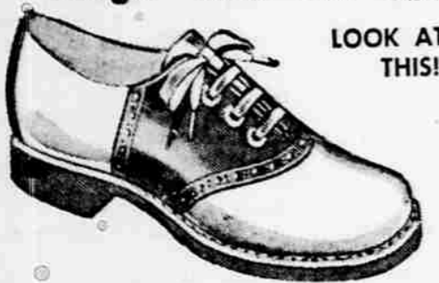
LOOK AT THIS!