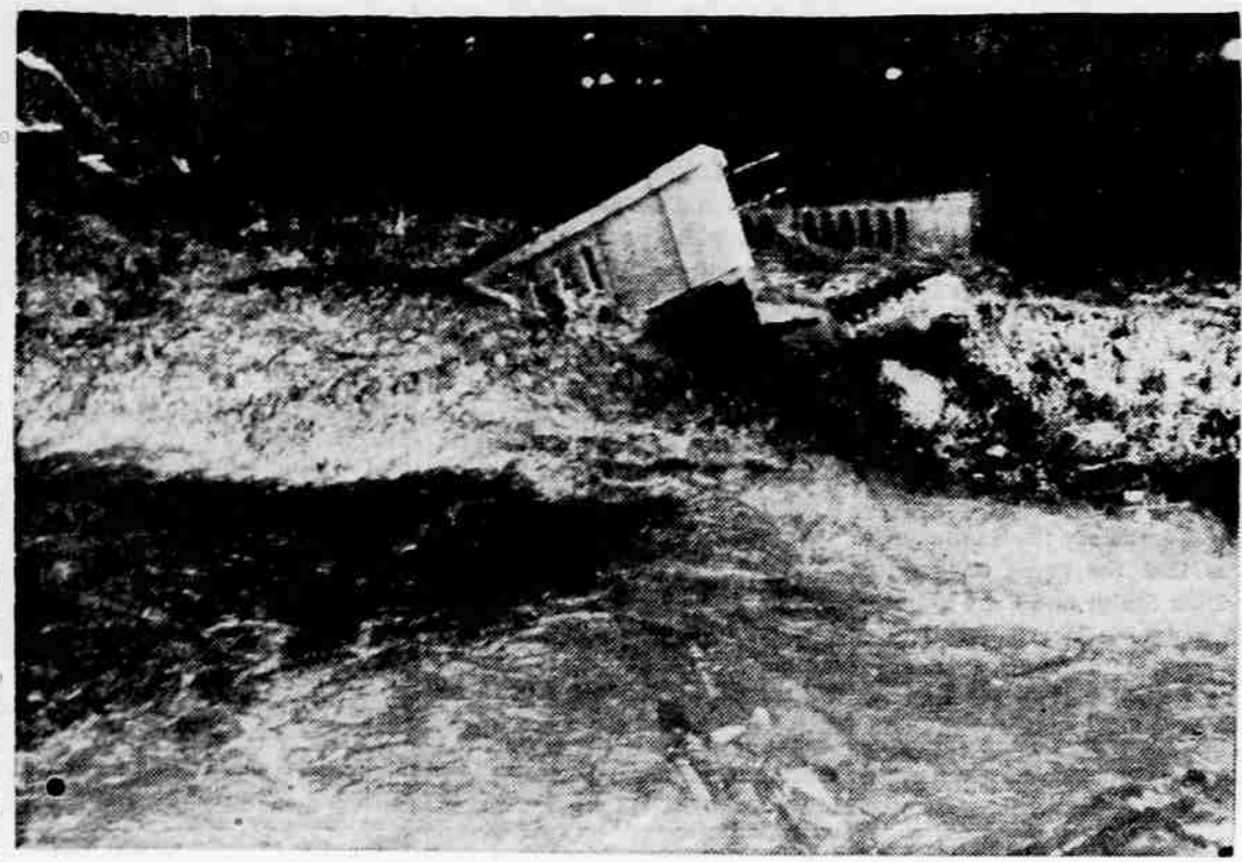
'TAINT FIT OUT FOR MAN OR BEAST—It's easy to see that traffic on Route 11 between Scranton and Wilkes Barre, Pa. is at a standstill as flood waters swirl around this washed out bridge. Torrents of rain dumped from dying hurricane Diane spread havoc and death across seven northeastern states.

AL DUMAS' MEDFORD Domestic Laundry & Dry Cleaning Home of Beautiful Dry Cleaning & Better Shirts 30 NORTH RIVERSIDE