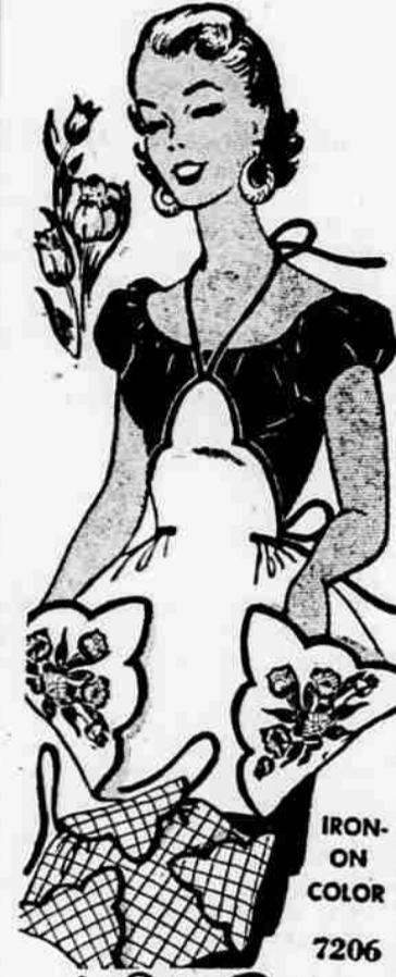
IRON-ON COLOR 7206 by Alice Brooks

One yard 35-inch fabric makes two smart aprons! Easiest sewing; iron on tulips in gay colors!