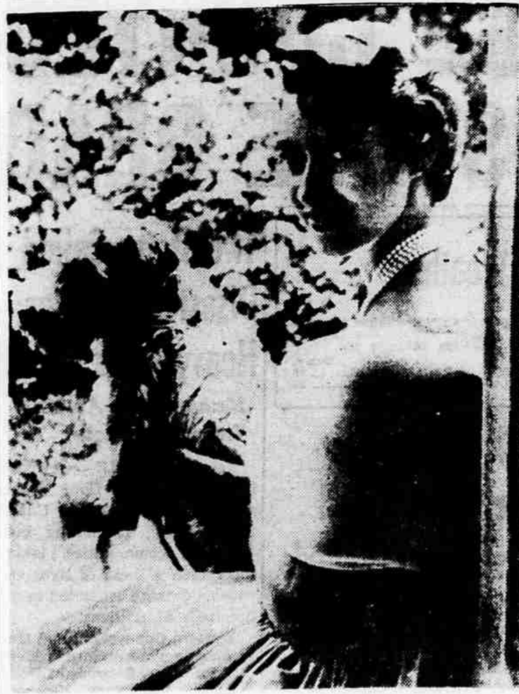
COMING OF AGE —This informal portrait of Britain's Princess Margaret with her pet dog was especially posed in the garden of Clarence House for release on her 25th birthday, Aug. 21. It was made by famed court photographer Cecil Beaton. In royal circles, a princess "comes of age" when she is 25. Margaret's coming age also takes on import because of the fact that, at 25, she is free to marry without the Queen's consent providing she gives Parliament a year's notice and no objection is raised in Parliament.