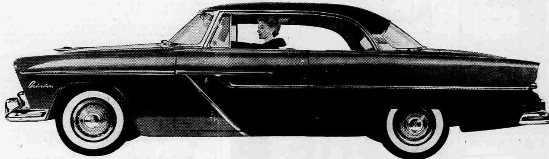
Actual photo of Plymouth Belvedere Sport Coupe, powered by the 6-cylinder PowerFlow 117 engine

top economy and satin smoothness; and the new 167-hp Hy-Fire, the most powerful standard V-8 in any low-price car. With three great lines—Belvedere, Savoy and Plaza—Plymouth is priced to fit every pocketbook. 22 models in all.