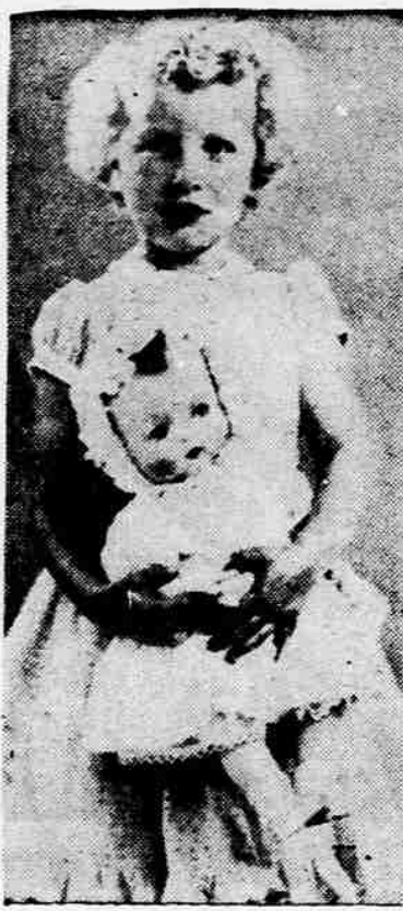
SPECIAL PORTRAIT — Britain's Princess Anne poses with favorite doll for this special portrait on occasion of her fifth birthday. The flax-haired Princess wears a blue anglaise dress edged with embroidered details.

RUMMAGE & Baked Food SALE 106 N. IVY Thursday, Aug. 18 9 a.m. — 5 p.m. Women of the Moose