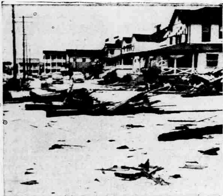
CONNIE WASN'T NEAT —Debris and driftwood are strewn all over the beach front streets at Wrightsville, N. C. after Hurricane Connie swept through. Damage mounted as winds up to 75 m.p.h. hit the town.