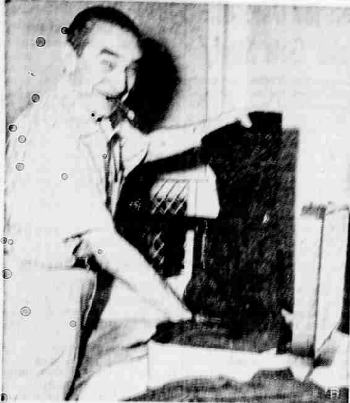
LEAVING HOSPITAL in Norwalk, Cal., with firm resolution not to disappoint his new-found friends, actor Bela Lugosi completes drug addiction treatment. The movie "Dracula" star committed three months ago, finds new faith in thousands of letters written to him expressing belief that he could overcome drug habit.