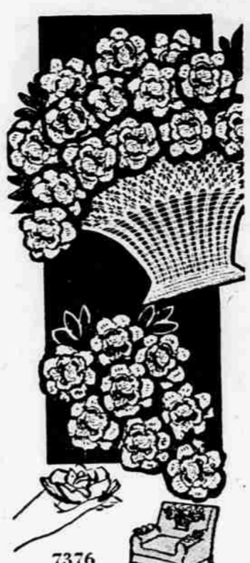
7376 by Alice Brooks

Basket of beautiful roses — standing up in like-like form! Color-crochet this chair-set for your own home — for lovely gifts!