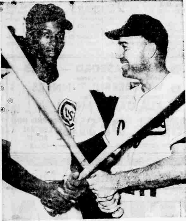
DUELISTS—Crossing bats as their paths cross in Chicago are the current home run leaders, Ernie Banks (left) of Chicago Cubs and Duke Snider of Brooklyn Dodgers.