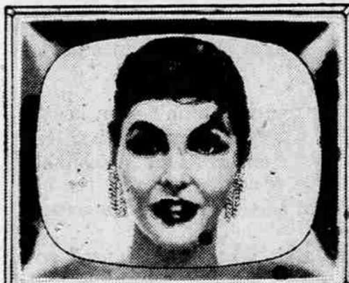
NEW "4-PLUS" PICTURE QUALITY—on all Super and Deluxe models. You get all 4 "plus" factors: (1) 100% automatic gain control for constant signal regulation; (2) "Sync" stabilizer that kills interference jitters; (3) 7% extra brightness; (4) 33% extra contrast.

Prices are unbelievably low for RCA Victor quality! Never before have you been able to pick from such a wide range of models, finishes, and prices. For the best TV shopping of your life—make a date to come in and see the Big Change in TV by RCA Victor!