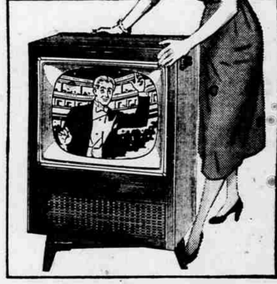
NEW RCA VICTOR 24-INCH HAVERTON DELUXE. Swivel convenience plus deluxe performance. Choice of two finishes: walnut with blond trim or hardwood or natural birch. Model 24D658. $399.50