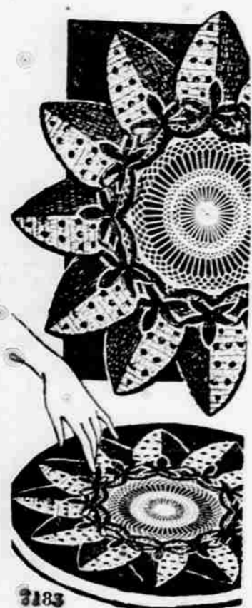
3183 by Alice Brooks

"Strawberries" in brilliant white and red leaves raised high in life-like splendor—make these stunning doilies for your home! Pattern 7183: Color-crochet modern "strawberry" doilies, 20 inches in mercerized crocheted and knitting cotton, smaller one to match. Send TWENTY FIVE CENTS in coins for this pattern—add 5 cents for each pattern for 12-class mailing. Send to Medford Mail Tribune Household Arts Dept. P. O. Box 168, Old Chelsea Station, New York 11, N.Y. Print plainly NAME, ADDRESS and PATTERN NUMBER. ORDER our 1955 Alice Brooks Needlecraft Catalogue. Enjoy pages and pages of exciting new designs—knitting, crochet, em-