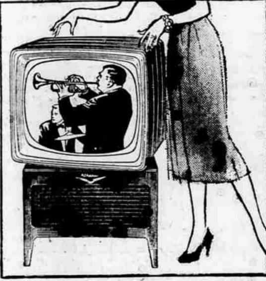
NEW RCA VICTOR 21-INCH PICKWICK Now—at a new low cost—here's TV you can see from anywhere in the room. This set turns—so you don't have to. Two speakers, too! Mahogany grained finish. Super model 21T6255. $269.95