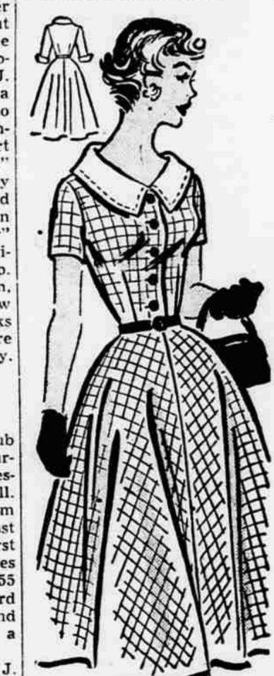
9069 by Marian Martin

Your favorite fashion, the "shirtwaist" frock! None prettier than this new version, with graceful stand-away collar, fitted bodice, soft flare skirt! Sew-perfect in ANY fabric—you'll want to sew many. Choose gay check gingham, cotton tweed, linen!