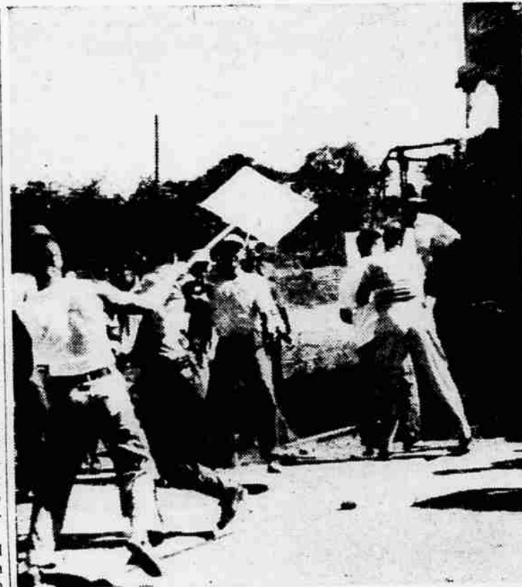
COPS AND PICKETS MIX IT UP —Police and UAW-CIO pickets take part in a pushing brawl at Westinghouse jet engine plant in Kansas City, Mo., during attempt to move Missouri Pacific freight train into the strikebound plant. The pickets violated a restraining order in keeping the train from the plant.

The U.S. has about 1,500,000 hospital beds and needs about 800,000 more, according to medical estimates.