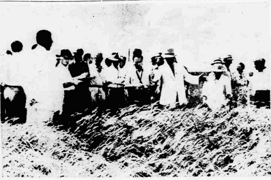
AMERICAN FARMERS IN RUSSIA —Members of the American agricultural delegation to the USSR examine the wheat harvest at the Kharkov State Selection Station during their visit to Russia.