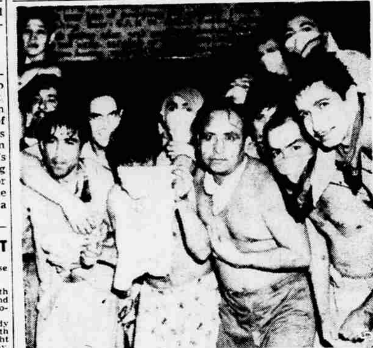
JEERING GUARDS, prisoners at San Antonio's Bexar County Jail riot over "undesirable" conditions, inadequate food, breaking windows, tossing furniture from cells.