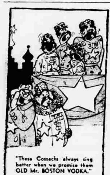
"These Cossacks always sing better when we promise them OLD Mr. BOSTON VODKA."