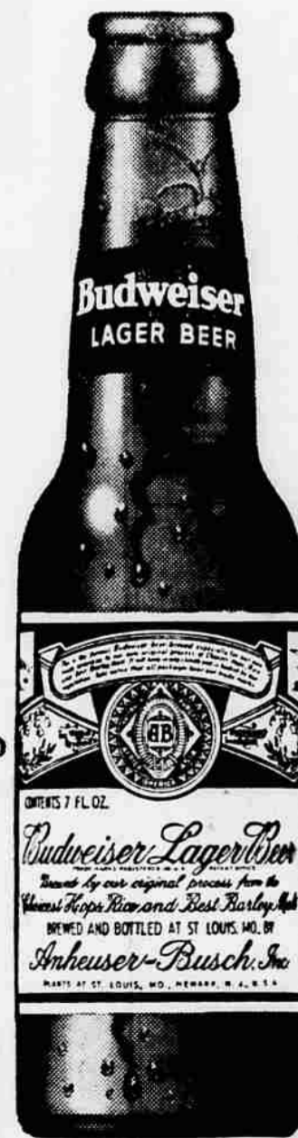
SEVEN OZ. BOTTLE