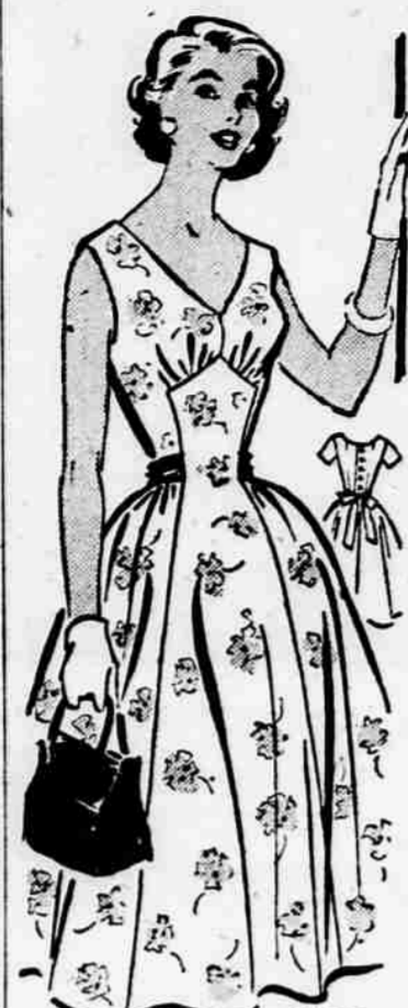
9397 SIZES 10-18 by Marian Martin

Pretty dress for summer—lovely as a fall fashion too—in two smart sleeve versions! Smooth front panel, beautifully accented by the soft gathers at bodice and waist. Deep "V" neckline, wide flare skirt—so very, very flattering. Sew it right away!