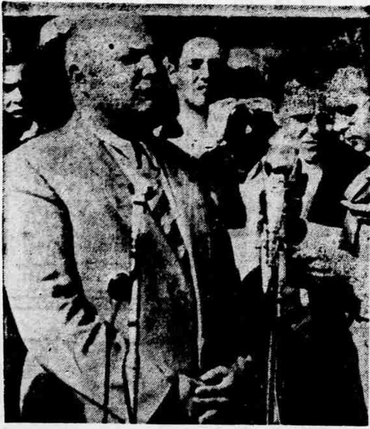
TOUR OF 'BREAD BASKET' —V. V. Matskevich, Soviet First Deputy Minister for Agriculture, thanks a crowd of two thousand waving Iowans at Des Moines for the invitation to the "bread basket of the United States," as he and 11 other Russians landed to start a twelve-day tour of the "tall corn state."