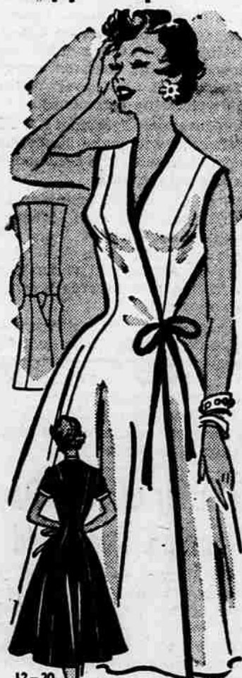
9019 by Marian Martin

Snappy wrap! Sew it 1-2-3 quick—no waist seams! Slip it on 1-2-3 quick — just wrap 'round, tie waist! So versatile—pop it on first thing in the morning, wear it shopping, gardening, cooking. Make several in crisp cottons, magic wash-and-wear nylons.