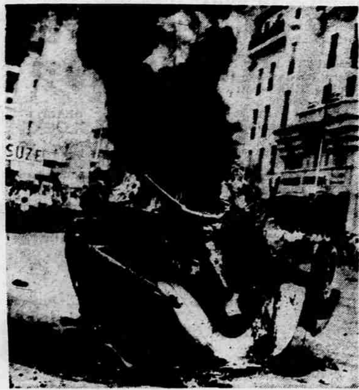
VIOLENT DEMONSTRATIONS —An overturned French-built auto burns in a Casablanca street after being demolished by demonstrators. Thousands of young Europeans began staging violent demonstrations, reportedly in response to a terrorist's bomb which killed six Europeans on Bastille Day. French Foreign Legionnaires and Senegalese riflemen moved into Casablanca's native quarters to smother new race riots and enforce martial law.

The loftiest oil field in the world is located in Colorado and at elevations that range from 7,800 to 5,800 feet in height. First Sunday school in the United States was believed opened in 1674 near Roxbury, Mass.