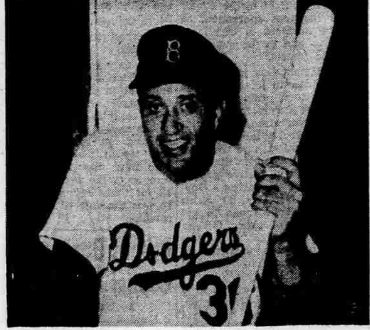
STARRING AT PLATE as well as on mound, Don Newcombe, Brooklyn pitcher wins 15th game of season with 8-hit pitching job against St. Louis Cardinals, poles his sixth homer of season to set record for National League pitchers, hits double and two singles to boost batting average to.407. Dodgers beat Cards 12-3 in Brooklyn.