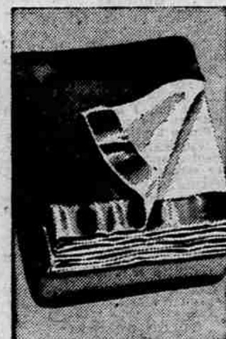
Wool Blend Reversible Blanket

"Carousel" rayon-wool Durafleece Blankets, fabulously washable... fashioned in brilliant stripes on white. 90% rayon, 10% wool. 72 by 90 inches. 3 1/2 pounds.