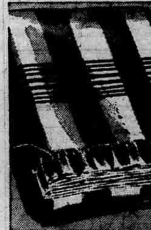
Part Wool Plaid Pairs

Reversible 90% rayon-10% wool Durafleece Blankets, light tones with deep-tone reverse. 72 by 90 inches. Wash beautifully.