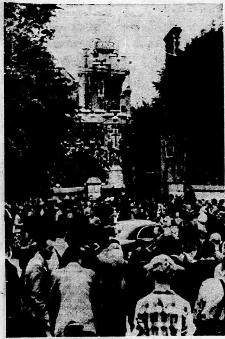
HANGING DRAWS CROWDS —Huge crowds mill around London's Holloway prison as blonde Mrs. Ruth Ellis is hanged inside for murder of one of her two lovers. The 28-year-old mother of two children was executed for pumping six pistol bullets into race driver David Blakely.