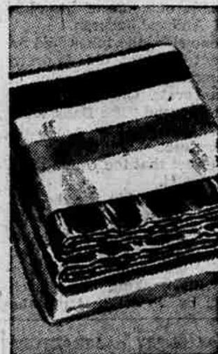
Washable Durafleece Blended Blankets

Dacron-Filled, Nylon-Covered Washable Comforters. Toss them in the machine for washing, they dry in an hour! White, pastels.