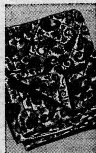
100% Dacron Filled Washable Comforters