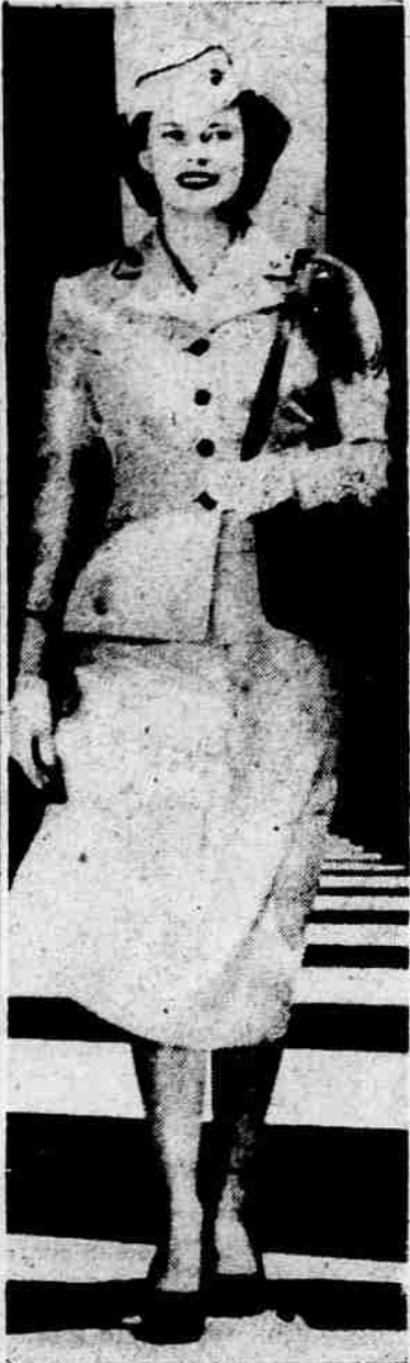
Sets The Pace

"Only recently, slums and sub-living standards were considered breeders of delinquency," Rand concluded. "Now that delinquency has been uncovered in all economic strata, the entire teen-age set is under a cloud. And they are chafing... they're openly resentful!"