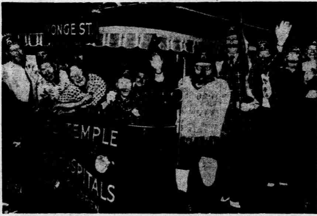
WHOOPIING IT UP for their amusement and Chicago's, Shriners from Rameses Temple, Toronto, board replica of 1888 streetcar for parade at international convention.

There are 10,000 WACs in service today — and it costs $3,000,000 less a year to feed, house and water them than 10,000 GIs.