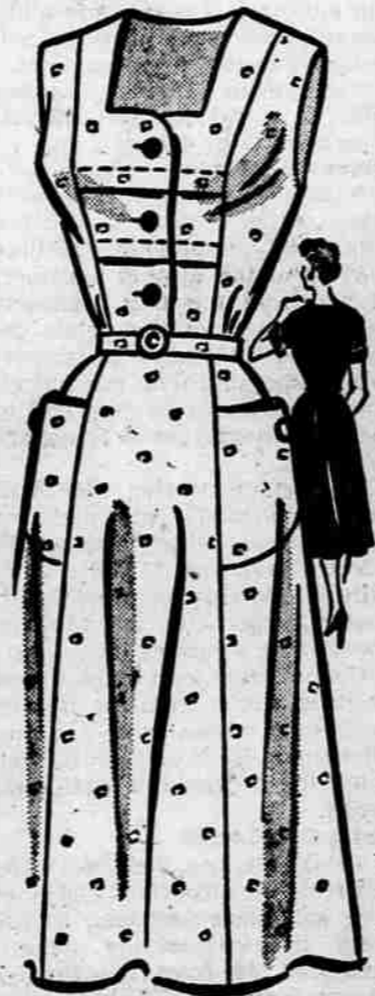
9014 SIZES 14½-24½ by Marian Martin

Here's an easy way to slim your figure! Sew this pretty dress—see how its graceful lines whisk the inches away! Bodice beautifully detailed with rows of tucks; skirt has a soft flare, smart hip pockets. Proportioned to fit perfectly—no alteration problems!