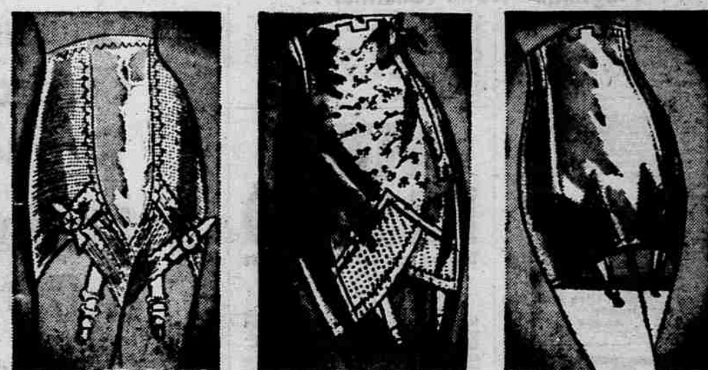
Designed for the Junior Figure

Swiss knit cuffs on this nylon power net girdle mean no rolling, no binding. Rayon satin elastic front panel, 2 tiny bones at top. White; sizes S, M, L.