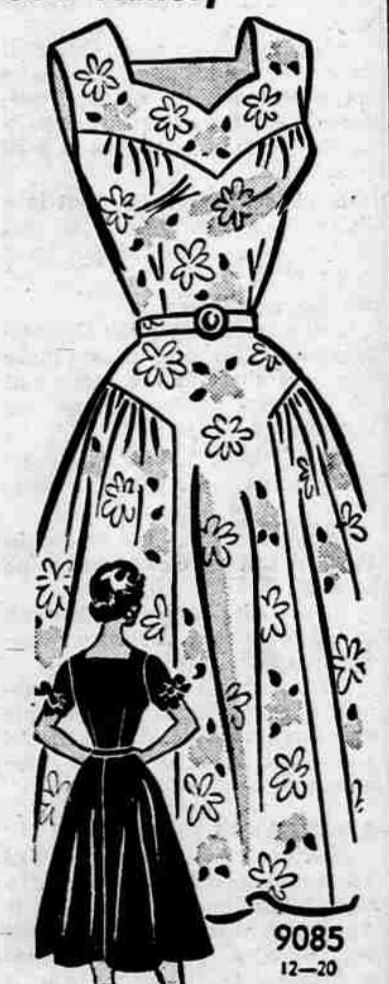
by Marian Martin

The soft summer dress—ideally feminine, always flattering! This graceful version derives its lovely lines from the soft gathers at yoke and skirt. Picture it now in misty-sheer voile or nylon—pretty with little bow-trimmed sleeves, or airy-cool sleeveless!