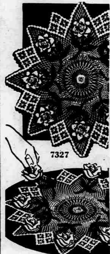
by Alice Brooks

Crochet roses in color—to decorate this most unusual doily! They stand up in lifelike form against their lovely background.