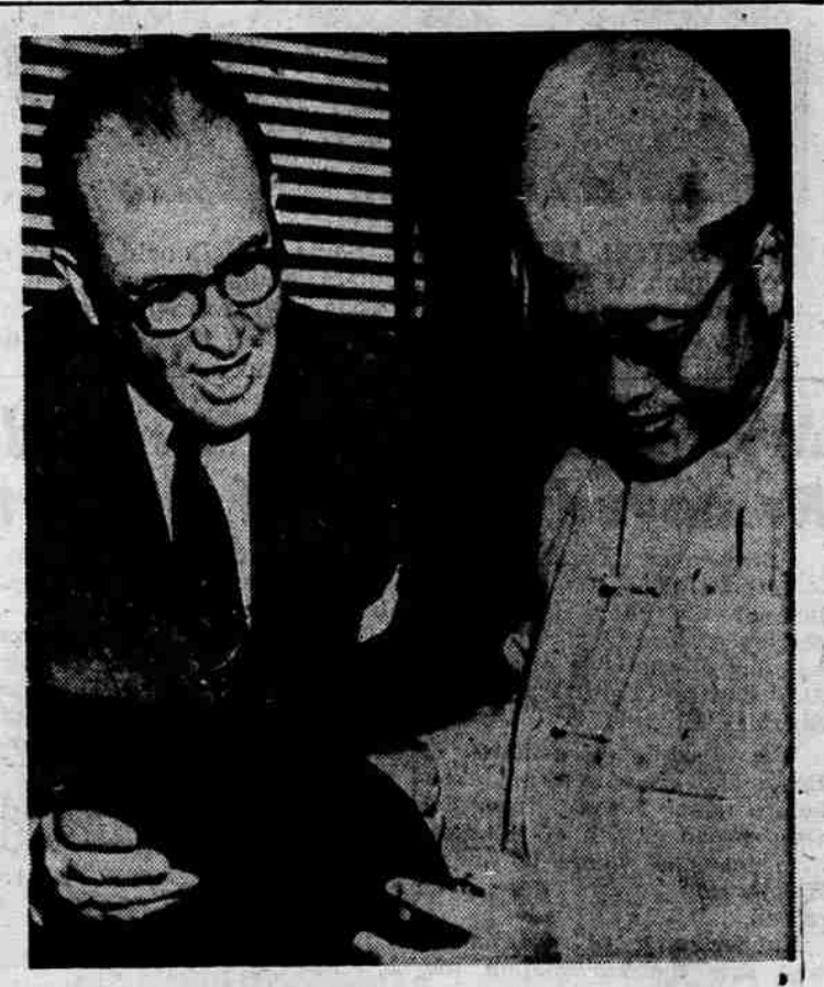
JUST A FRIENDLY VISIT —Burmese Prime Minister U Nu calls on Agriculture Secy. Ezra Taft Benson in his Washington office for what he described as a "friendly" visit. The prime minister walked away from a scheduled meeting at the Agriculture Department because Benson was five minutes late in receiving him. Here Secretary Benson shows the minister photographs of the Benson family.