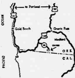
Map traces route taken to the marbled caves on motorlog, touching California.

raised above the sea as part of a mountain range. It was during this uplifting that the marble was broken in many places. Through these fractures water carrying carbonic and other acids began to dissolve the caverns.