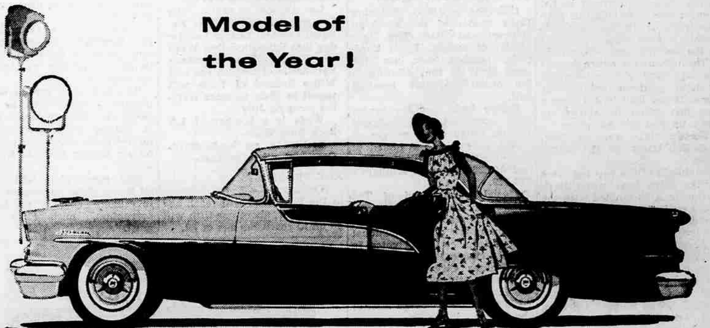
Ninety-Eight DeLuxe Holiday Sedan.

the only 4-door hardtop in the finest car field!