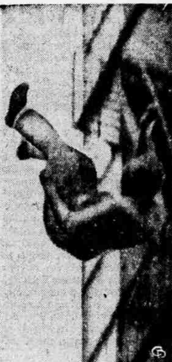
LEAPING from eleventh floor of downtown Los Angeles building, an unidentified grey-haired man kills self. (International)

A distance of 2897 miles separate Point Arena, Calif., and West Quoddy Head, Maine — the widest part of the United States.