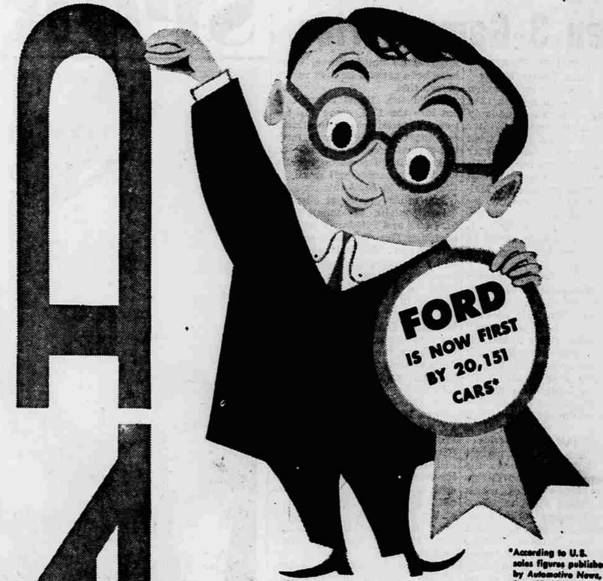
*According to U.S. sales figures published by Automotive News, June 13, 1955