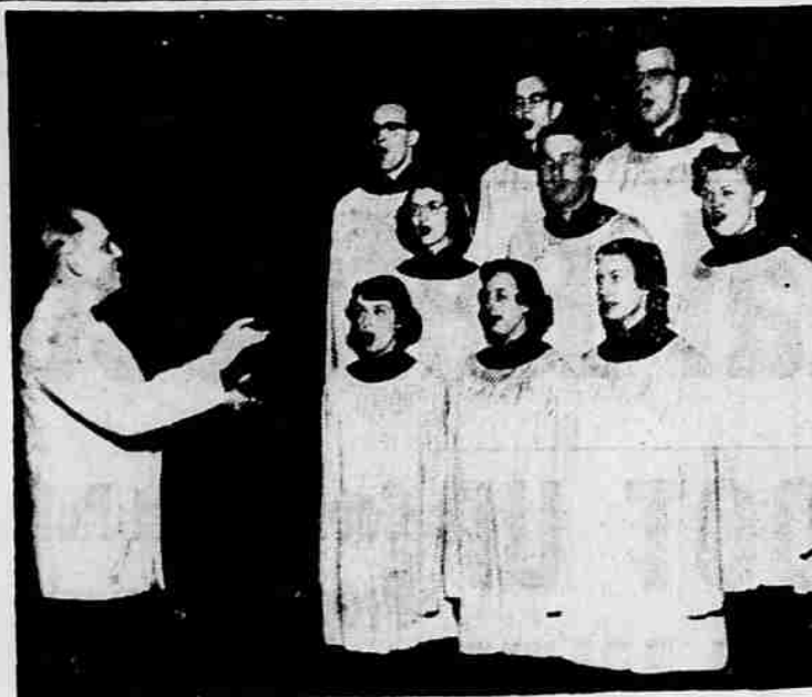
FAMED VOICES HERE — The Chapel Choir of Capital University, Columbus, O., will appear at the Zion Lutheran church, Fourth st. and Oakdale ave., at 8 p.m. today. The 40-voice group will present a concert of sacred and secular numbers, entirely a cappella. The public is invited. A free will offering will be accepted.