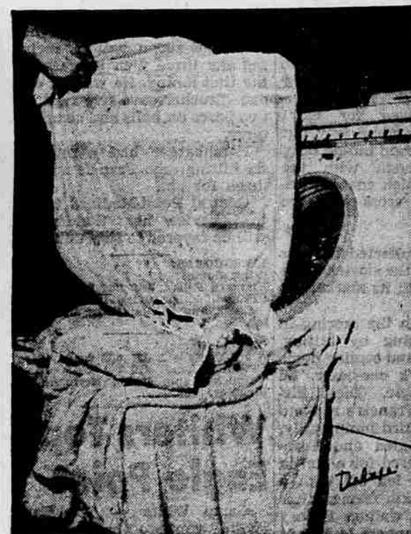
Photo above shows towels being removed from the Westinghouse Laundromat. There was no trace of sand on the towels or in the Laundromat tub.