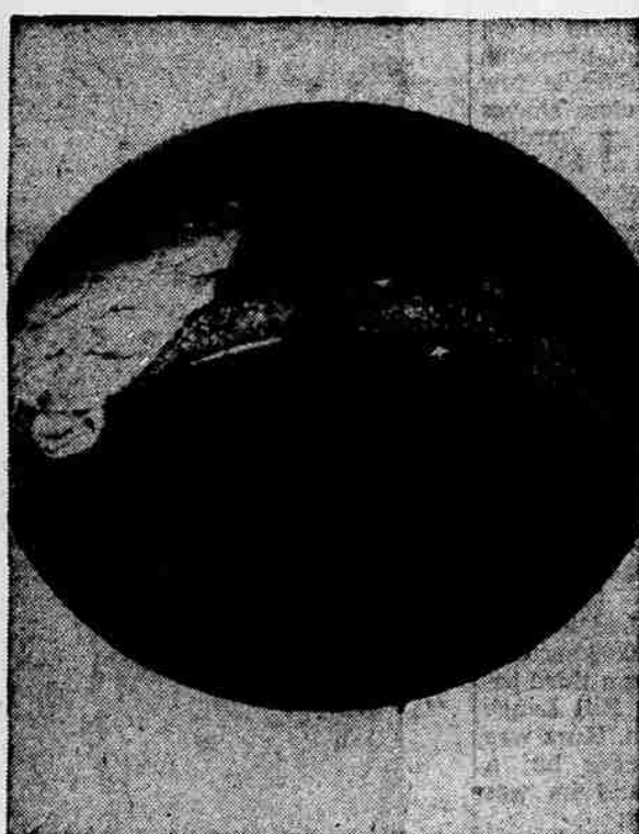
The photo above shows that almost half a cup of sand remains in the bottom of this agitator washer tub, the remaining sand being embedded in the towels.