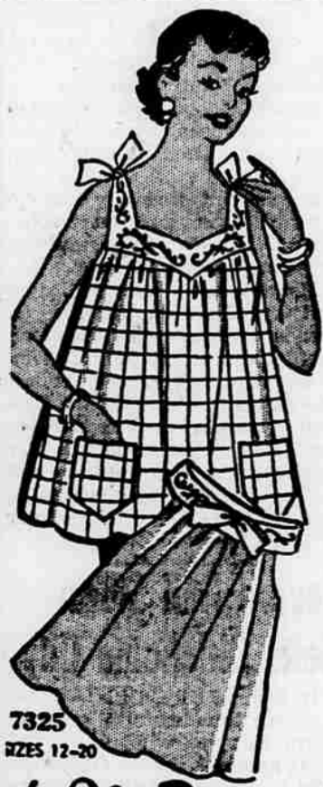
by Alice Brooks

The summer session enrollment figures revealed a sign-up of 125 men and 280 women. A total of 95 students are enrolled in graduate status.