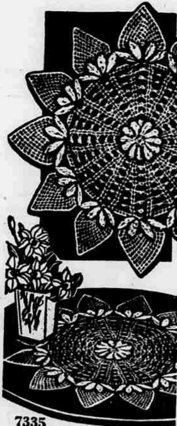
7335 by Alice Brooks

Fresh-up for summer! Crochet this pretty doily — in sparkling colors! Luscious "strawberry" design, with dainty lace center. Pattern 7335: Crochet "strawberry" design doilies; larger 17, smaller about 12 inches. Use No. 30 mercerized cotton in gay color!