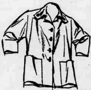
Long or Short Sleeve Jackets $6.98