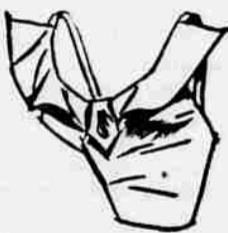
Sun Top $3.98