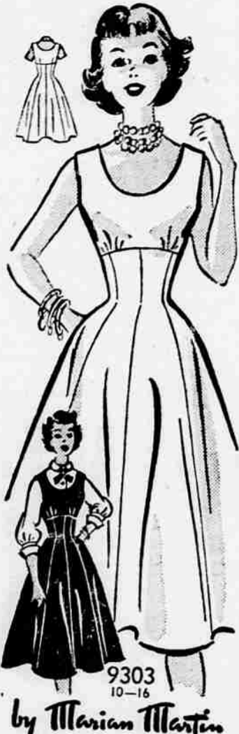
9303 by Marian Martin

A teen-in-the-know will insist on this versatile princess fashion! She'll adore the "grown-up" empire lines, nipped-in waist! She'll wear it as a sundress now—again in jumper-style come fall, with its smart companion blouse! Sew-easy—she can make it herself!